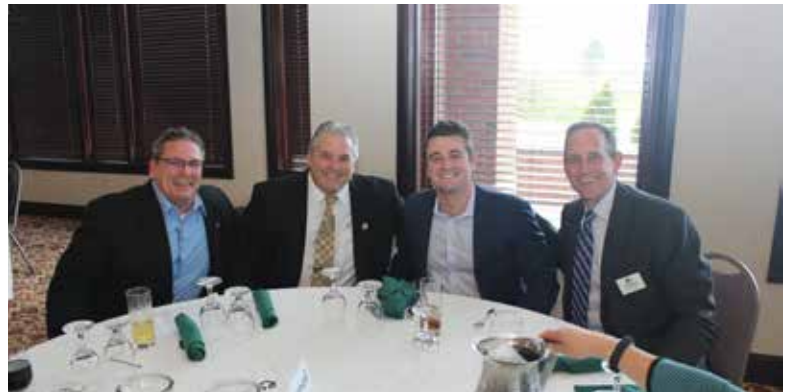
Festa workers sneaking in a meal before the hard work begins!