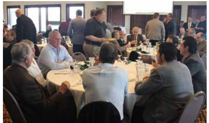
It's getting close to start time!