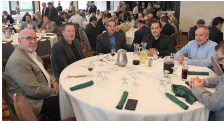
Members awaiting the appetizers and food stations!