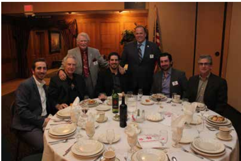
Members enjoying some appetizers and fine wine.