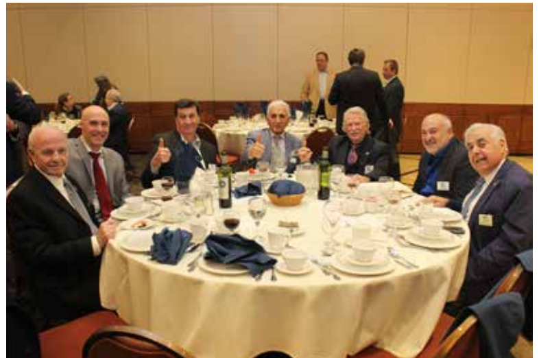
"Thumbs Up" to a great evening!