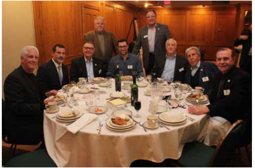
IACCM friends and family bonds last a lifetime!