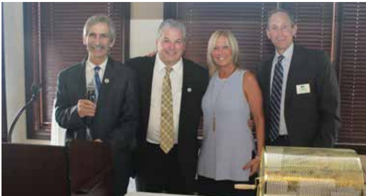
Our ticket pullers for the night, good luck to everyone!