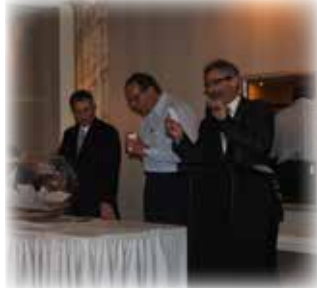
The committee making sure everything runs smoothly!