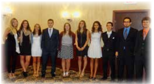
2014 attending scholarship recipients