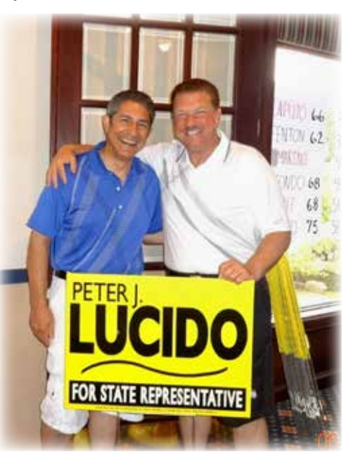
Last minute campaign push!