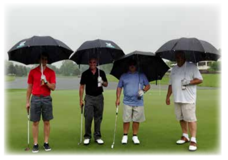
Rain!! Not again...umbrellas were not out for long!