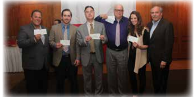
The lucky winners!