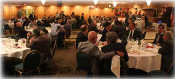
Another sell-out crowd anxiously awaits the evenings festivities!