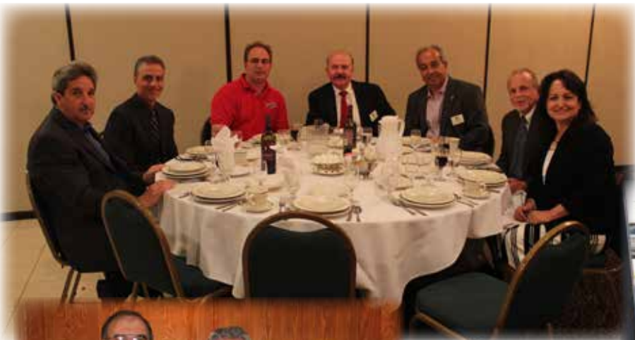
Members and guests awaiting the award presentation and dinner