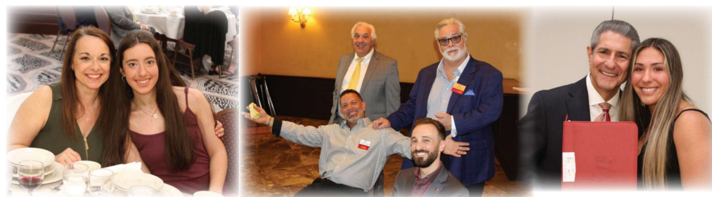
The Board of Directors working hard!