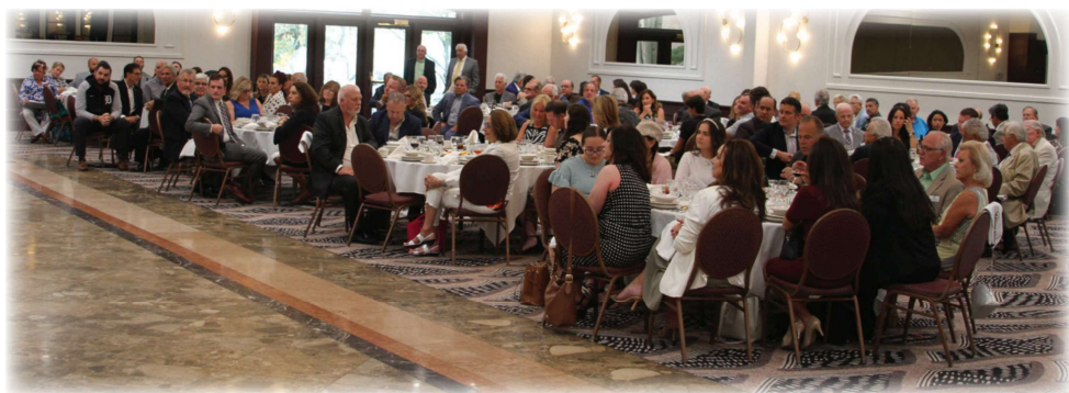
A packed house for the scholarship award dinner!