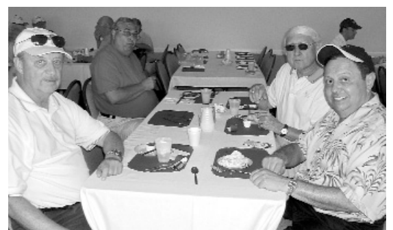
Golf outing participants enjoying a fabulous breakfast.