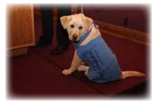
Proceeds from the Festa Della Lira basket of cheer go to benefit "ruff" and the Leader Dogs for the Blind!