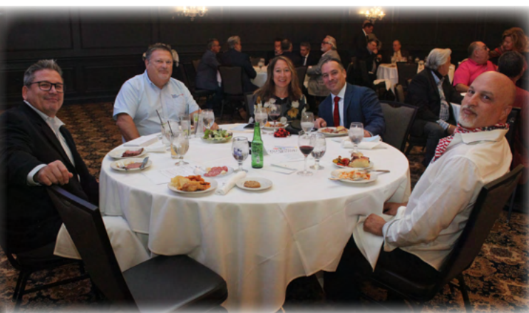
The Festa Della Lira committee grabbing a quick bite before the festivities.