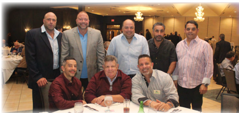
The annual Licata table!