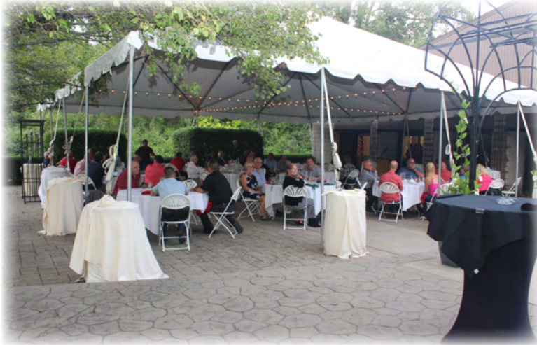
The beautiful outdoor set-up for a perfect evening!