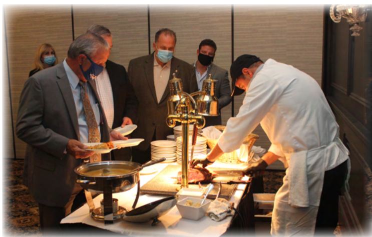
The fantastic beef carving station at Andiamo Italia