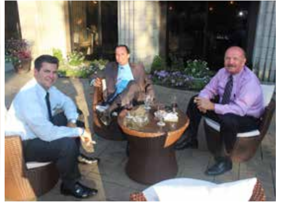
A little wine on the patio before dinner!