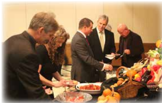
Members enjoying some delicious appetizers