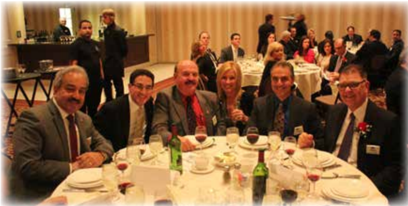
Members anxiously waiting for dinner!