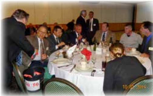
Members hoping to get lucky with 50/50 raffle