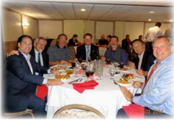
Members enjoying a great meal!