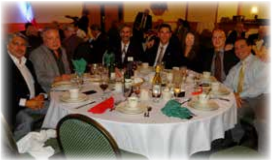
Dinner is about to be served! Cheers!