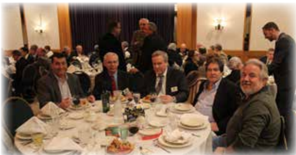
Dinner time! Mangia, Mangia!