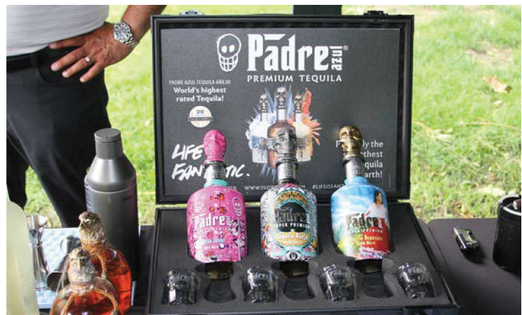
Padre Azul tequila, the best around! Tastings were available and a 3 bottle raffle. Thank you for your sponsorship!