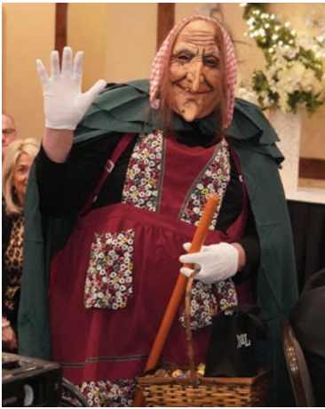
The Italian Folklore tradition of La Befana on the eve of the Epiphany, sweets to the good and coal to the naughty