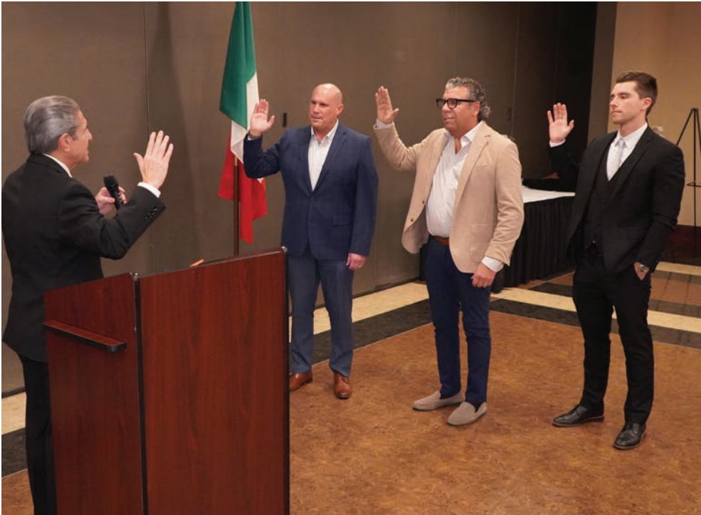
Honorable Joseph Toia swearing in the newest members for 2026