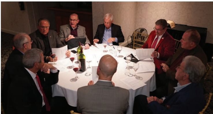
Your Board of Directors hard at work